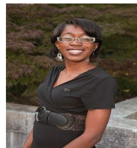
Malaysia Christian Lab Technician